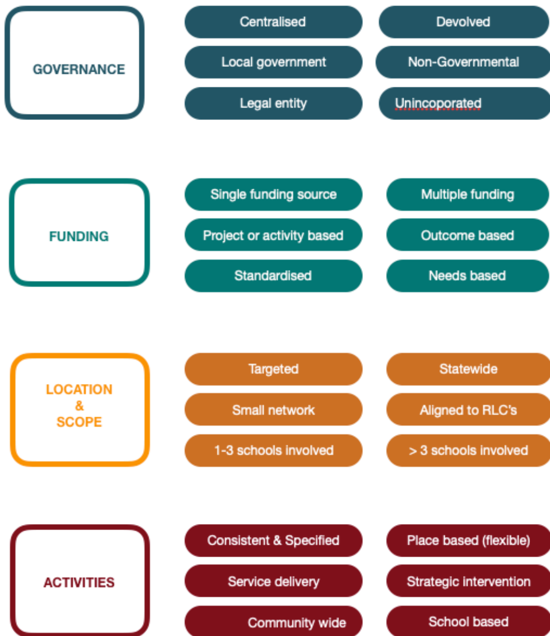
FIGURE 2: Functioning of a Local Learning Community /Model

Every community has its own specific challenges, needs and working methods. The figure below schematically shows how the LLC's can differ from each other. Differences in 'Organization', 'Funds', 'Location' & 'Scope and Activities'. Sister Schools provides support in shaping the LLC's, with the goal that these units can eventually function on their own.